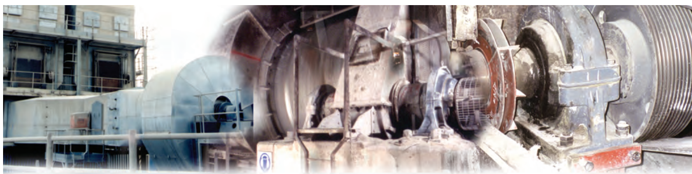
Ball Mill Bearings