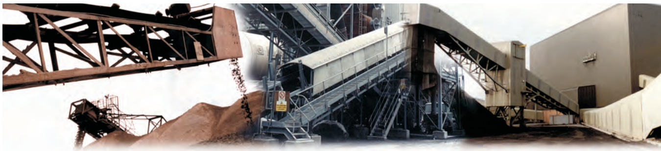
Feed Mill Elevator