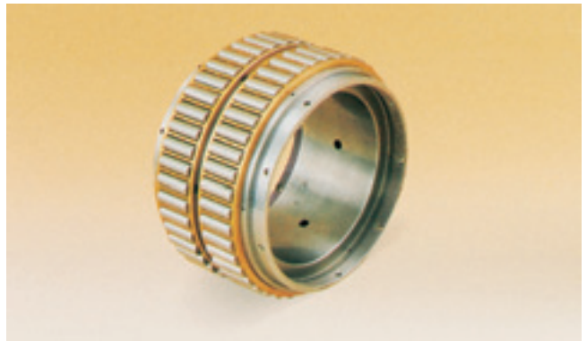
Reduction gear bearing