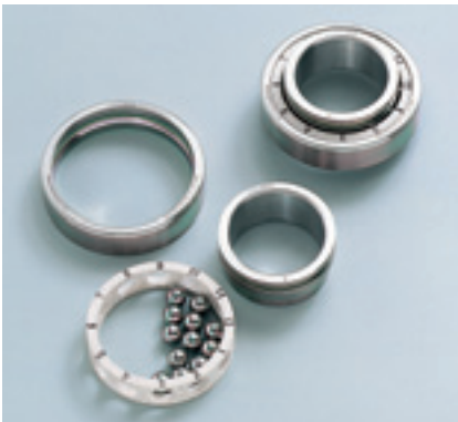
Liquid Hydrogen Turbo Pump Bearings