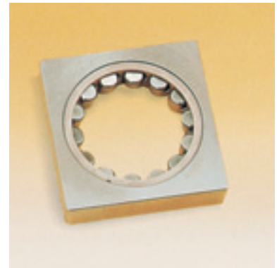
Reduction gear bearing