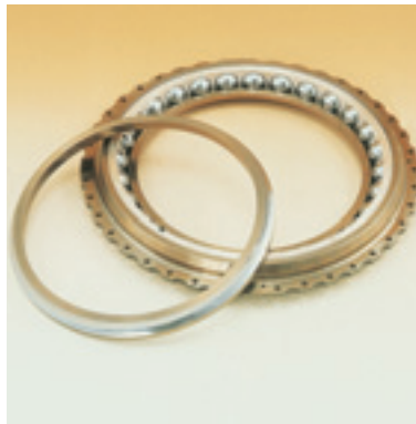
Main shaft bearing

RJ500 (Joint Development of Japan and England), V2500 (Joint Development of Japan, USA, England, Germany, and Italy)