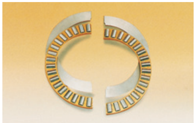
Propeller shank bearings

Major propellers in which NTN bearings are employed 63E60 (HAMILTON STANDARD LICENCE) 54H60 (HAMILTON STANDARD LICENCE)