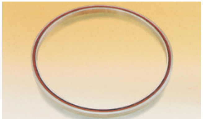
Swash plate bearing