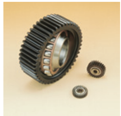
Reduction gear bearing