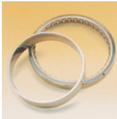
Main shaft bearing