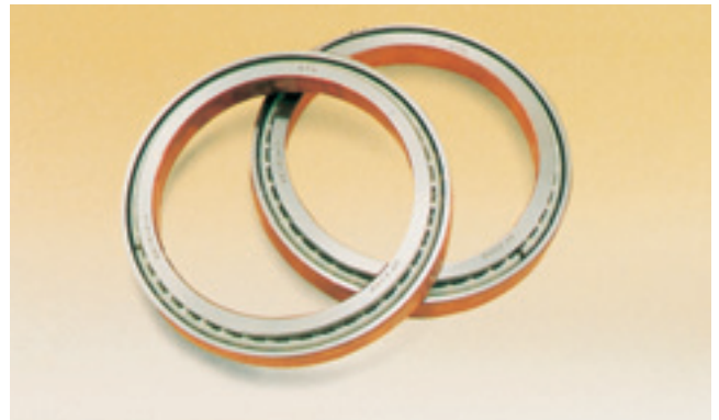
Rotor blade retention bearing

S-61 (SIKORSKY LICENCE) HSS-2/-2B (SIKORSKY LICENCE) KV-107 (VERTOL LICENCE) BK117 (Joint Development of Japan and Germany) UH-1H (BELL LICENCE) OH-6J (HUGHES LICENCE) AH-1S (BELL LICENCE) OH-1 (DOMESTIC PRODUCT) MH2000 (DOMESTIC PRODUCT) MD900/902 (Joint Development of Japan and USA) AB139 (Joint Development of Japan and Italy) SH/UH-60J/K (SIKORSKY LICENCE)