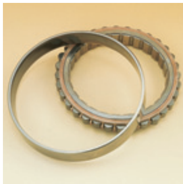
Main shaft bearing