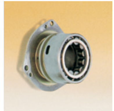
Reduction gear bearing