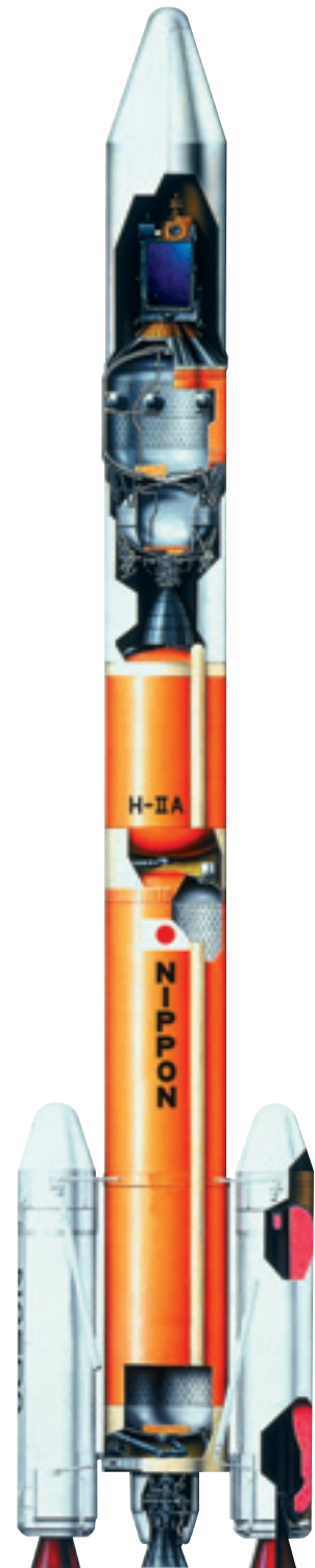
H-IIA Rocket Standard Model